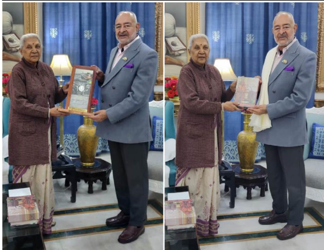
Admiral D K Joshi, PVSM, AVSM, YSM, NM, VSM (Retd.), Hon'ble Lt. Governor, A&N Islands and Vice-Chairman, Islands Development Agency during his visit to Lucknow called on Smti Anandiben Patel, Hon'ble Governor of Uttar Pradesh. Hon'ble Lt. Governor also briefed Hon'ble Governor on the mega infrastructure, Tourism projects being implemented in A&N Islands by Andaman & Nicobar Administration.

Regn. No. 34190/75 No. 24 Port Blair, Wednesday, January 24, 2024 Web: dt.andaman.gov.in Rs. 3.00 Pages 4